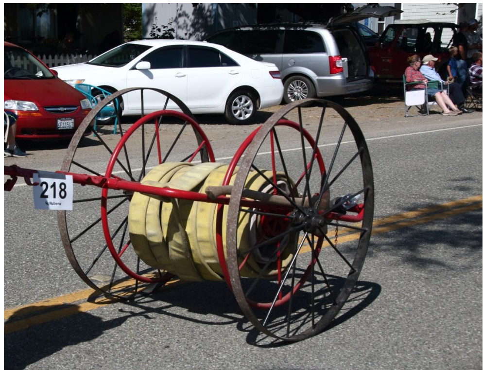
Orland's Antique Fire Hoses Took 2nd Place in the Novelty Category