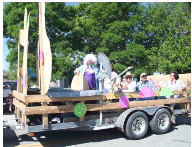
The Elk Creek Bible Church won the 1st Place Prize for Floats