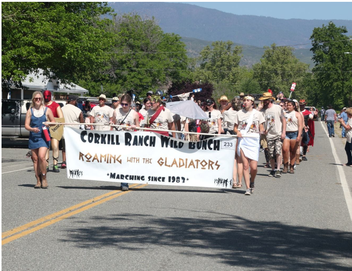
The Corkill Wild Bunch Came as Roman Gladiators and Took 1st Prize as a Drill Team