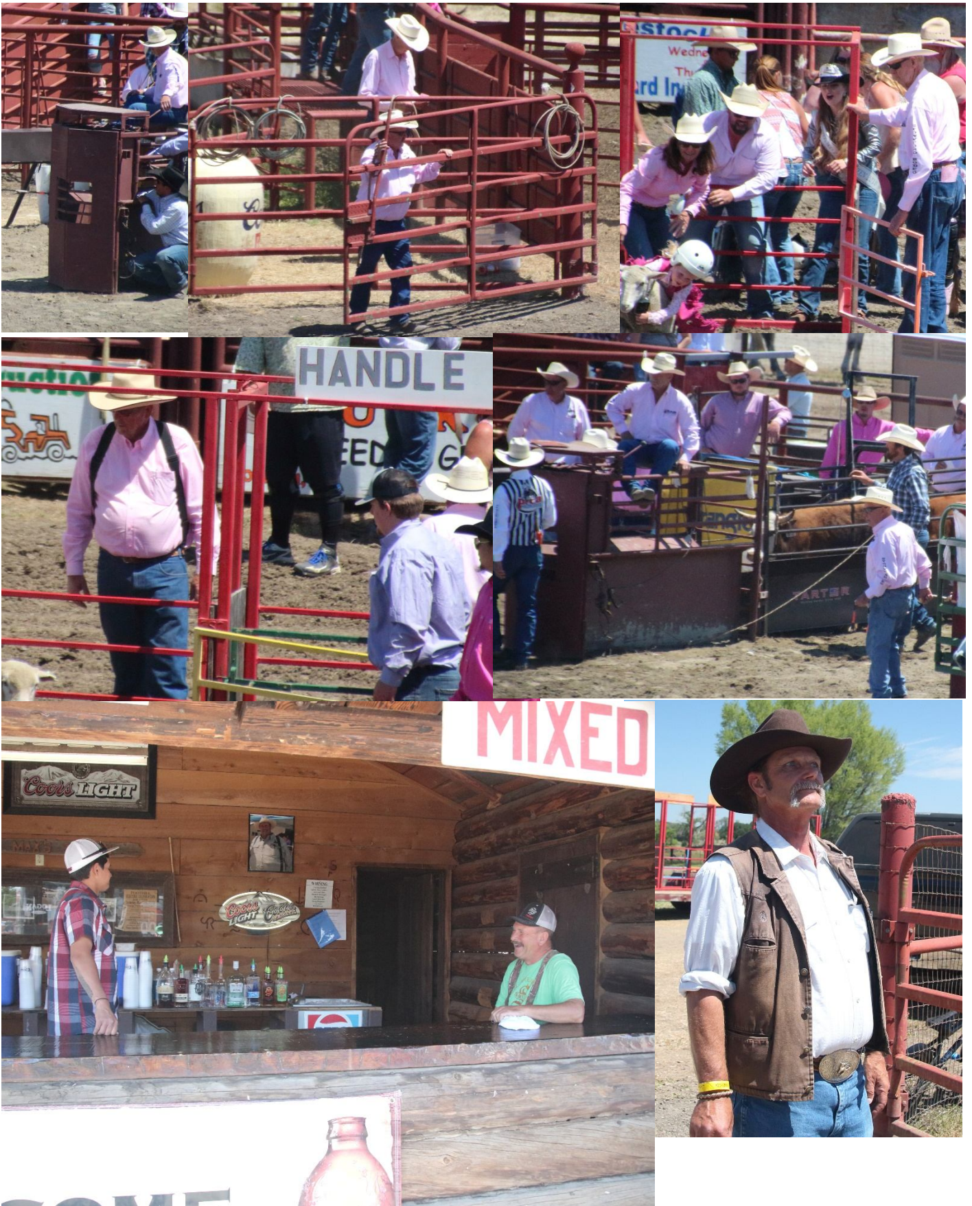
Some of the workers at the 2018 rodeo