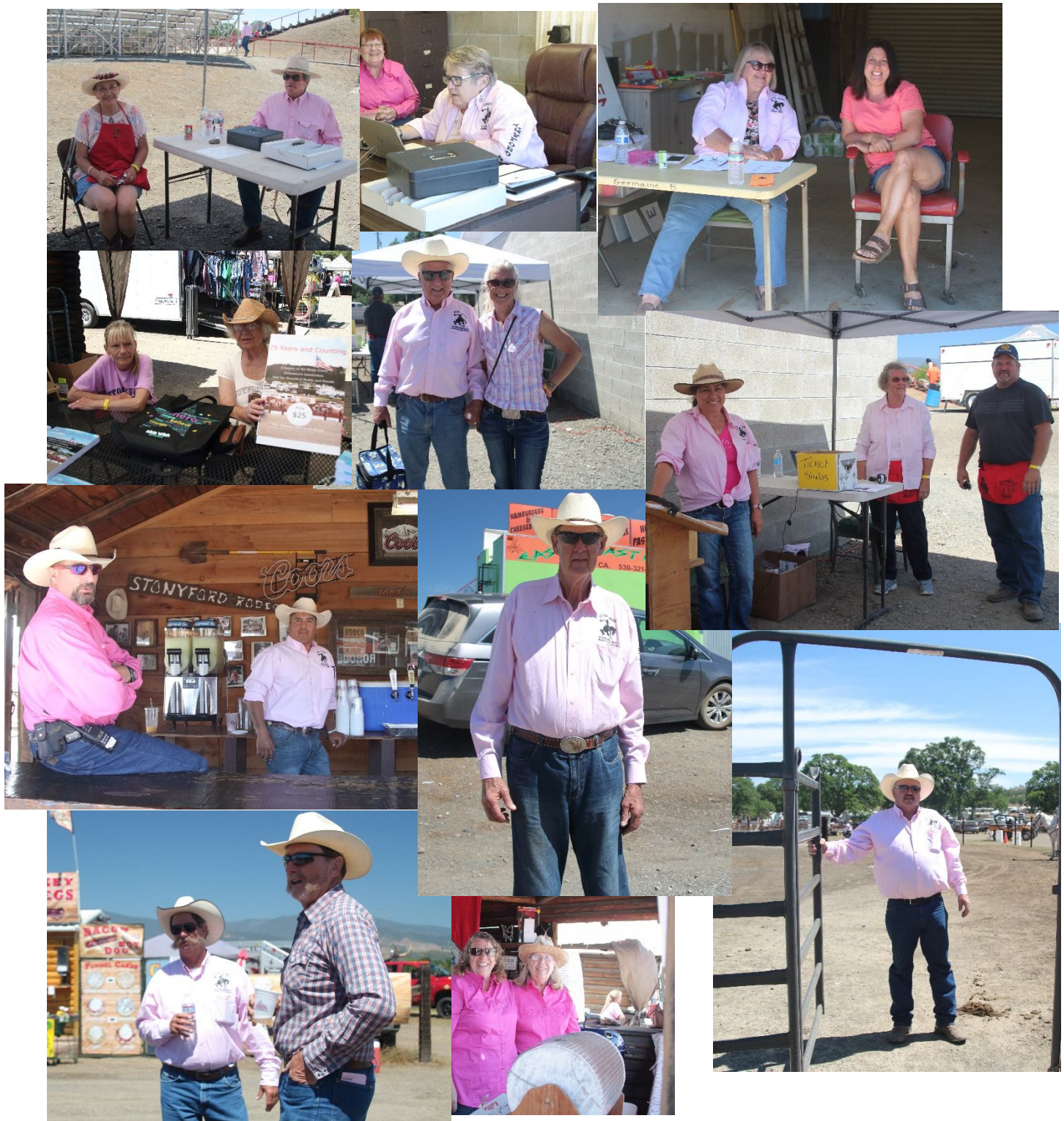
More workers at the 2018 rodeo