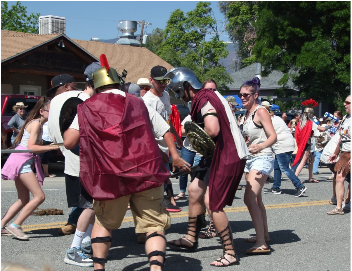
The Corkill Glaiators do Mock Combat in Front of the Reviewing Stand