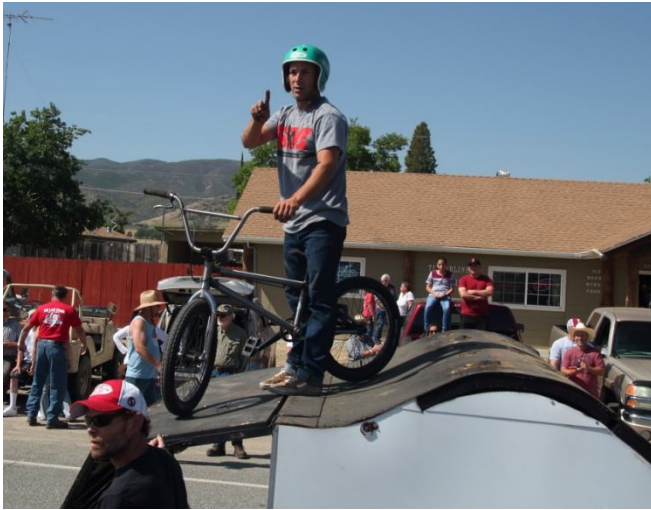
The Gypsy Ranch Entry was the First of Its Kind in the Stonyford Parade