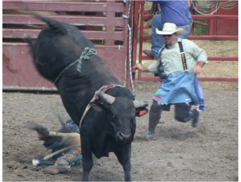
The bullfighter saves the cowboy from injury after he was thrown.