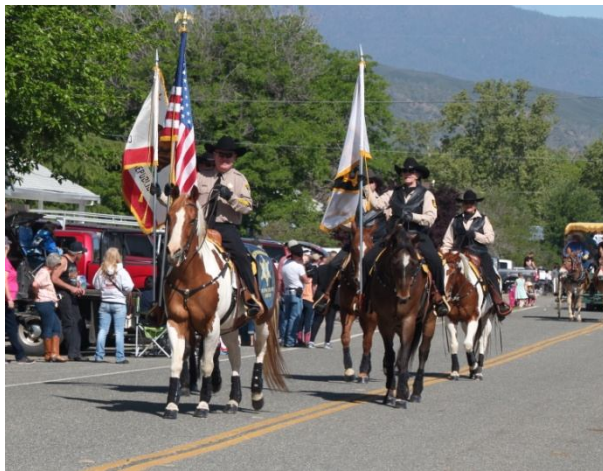
Glenn County Sheriff's Posse took 1st Place Prize for a Marching Group