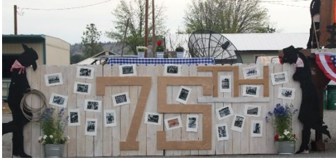
Reviewing stand decorations.