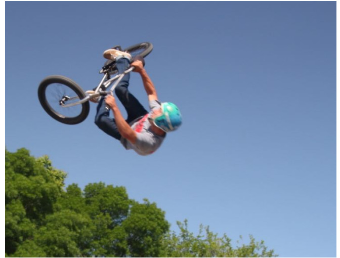
The Gypsy Ranch Biker Takes Off and does a Thrilling Loop High in the Air