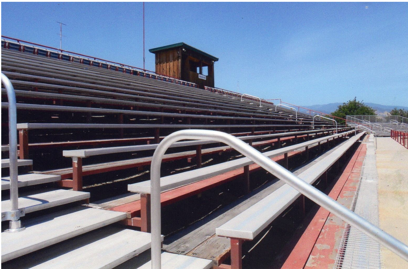
Arena grandstands showing the new aluminum seating.