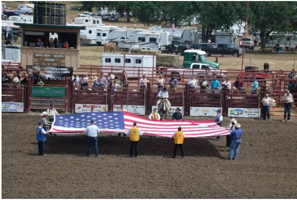
American Legionnaires from the Maxwell, California, post present a moving tribute to America's veterans during the Opening Ceremony.