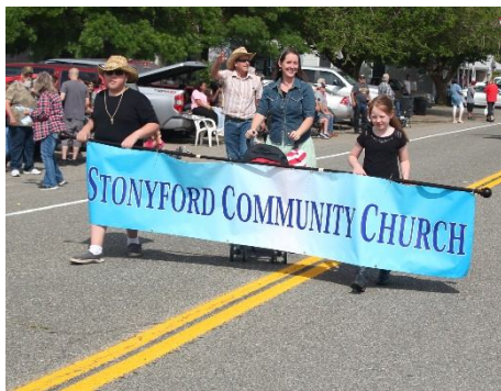
The local Stonyford Community Church on parade