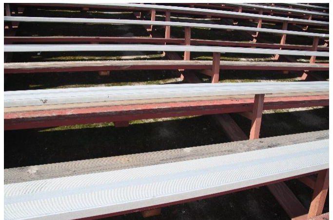
Moving to this new aluminum seating. Big improvement, don't you think?