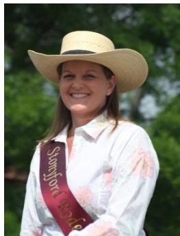
A Stonyford Rodeo Queen from a past year