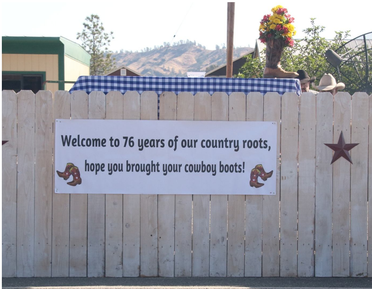
2019 Parade Reviewing Stand